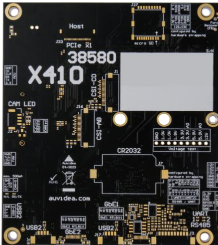
X410-LC (flat bottom side with no components)