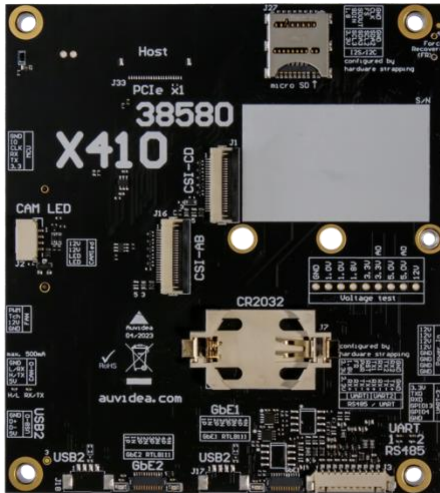
X410-AI bottom side